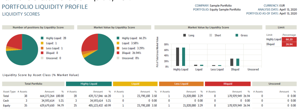
Front page of a LiquidityMetrics standard report

❖ Time-to-Liquidation - one of the most widely used measures of liquidity is the expected trade horizon, i.e., how long it takes to sell a position without a significant price impact. This time-to-liquidation measure is calculated for all positions and can be used to identify the least liquid holdings. Based on the time-to-liquidation horizon, holdings can be assigned to predefined and customizable liquidity buckets. The proportion of less liquid holdings breaching a certain limit may, for example, trigger the LRM oversight team to closely analyze the results and take corrective actions. The image below from a LiquidityMetrics report depicts the liquidity buckets by market value, position and asset class. Breaches of the predefined liquidity limits are highlighted (top right of the image) and can be used to warn of elevated levels of liquidity risk.