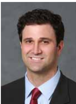
Sala: assessing costs

As might be expected, hedge funds have been by far the largest adopters of outsourced fund administration to date, followed by private equity firms. While private equity real estate funds manage more than an estimated $414 billion in commitments 2 , they have lagged behind other types of funds in terms of outsourcing.