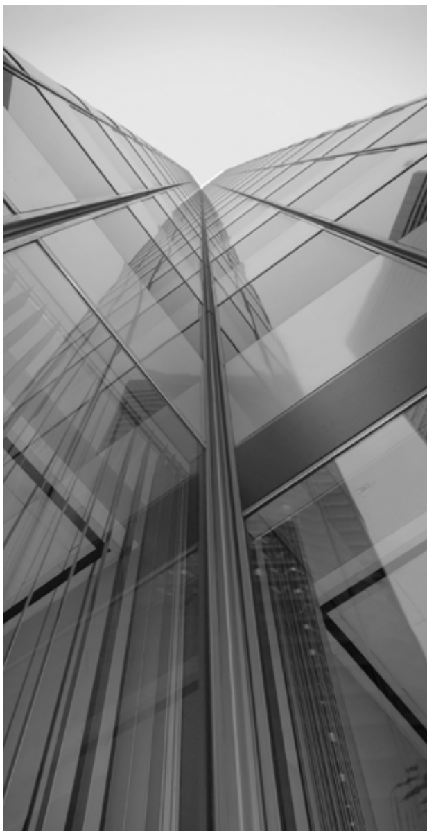
Real estate: technology and fund admin as important as bricks and mortar