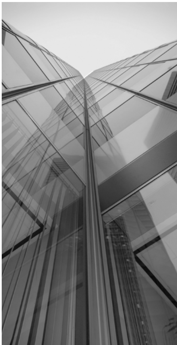
Real estate: technology and fund admin as important as bricks and mortar