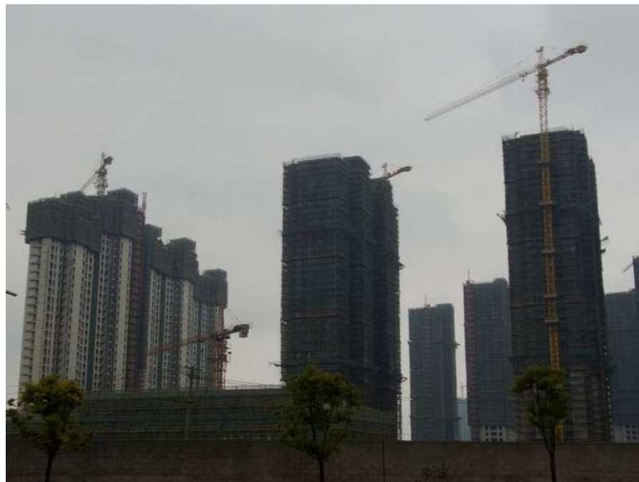
Sanlin Affordable Housing Development, developed by Shanghai Construction Group

A crucial corollary to the government's campaign to curb speculation is its commitment to boost the supply of affordable housing. Last year, local governments largely met the national policy housing target, achieving starts of 5.9 million units and completions of 3.7 million units. Although 2010 was already a record year for policy housing construction for most provincial governments, the 2011 campaign is set to be still more aggressive with a target of 10 million units. Affordable housing starts are expected to represent more than 35% of construction starts in 2011. In particular, Shanghai aims to start 220,000 and complete 170,000 units in 2011. The city government has promised that 5% of all new homes to be built this year must be affordable and is targeting 1.2 million units of affordable housing supply over the next five years.