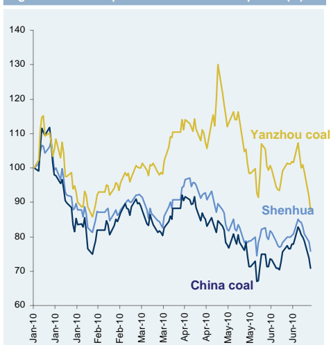
Figure 1a: Relative performance of coal companies (%)

China's National Development and Reform Commission (NDRC) recently directed the country's major coal producers to abide by contract coal prices agreed at the start of the year. According to a statement published by the NDRC, coal miners have been asked to return any extra income from additional price increases before the end of June and secondly, to refrain from initiating spot price increases. Without any indication as to how long these controls will remain in place, Chinese coal stocks have been rattled by investor concerns about future margins (see Figure 1), although coal companies continue to make good profits at current price levels.