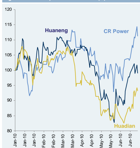
Figure 1b: Relative performance of IPPs (%)

The new controls appear designed to manage inflationary expectations and to discourage coal miners from exacting higher-than-contracted prices from power producers that stand at risk of incurring losses this year (and for whom coal accounts for ~70% of costs). With more than 40% of power producers operating at a loss in the Jan-May period, this effort to contain coal prices provides a near-term alternative to hiking electricity prices at a time when policymakers do not want to see inflationary pressures increase. We note that the new price controls are not as extreme as those implemented in July 2008, when the NDRC capped the FOB prices of coal at major ports at the June 19 level (after earlier requiring coal producers to settle contract prices and cap mine-mouth prices below this level). With CPI inflation expected to moderate from July/August, we do not believe this action necessarily signals wider government intervention in pricing.